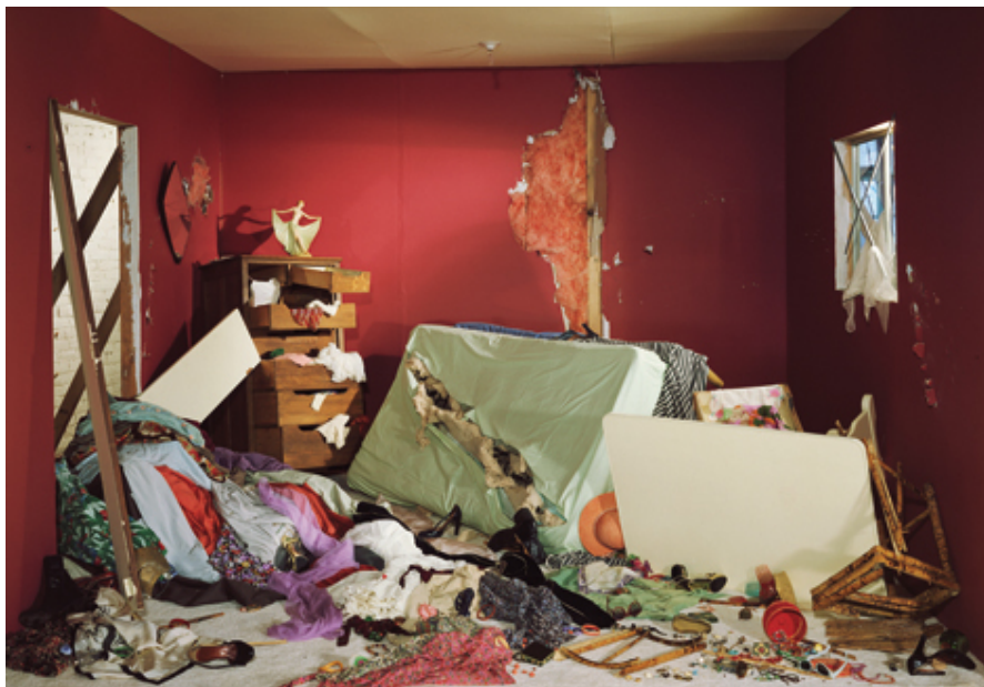
Jeff Wall, The Destroyed Room , 1978. Transparency in lightbox.