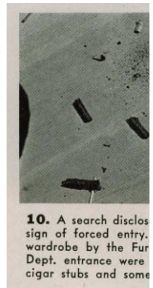
10. A search disclosed sign of forced entry. wardrobe by the Fur Dept. entrance were cigar stubs and some

The reader was supposed to examine the evidence and solve each crime, but what really fascinated was the process of staging. How had these images been made? How could you make a photo look like an image of a crime scene? Divola's photograph also recalled a travelling police display that once came to my town. A flatbed truck