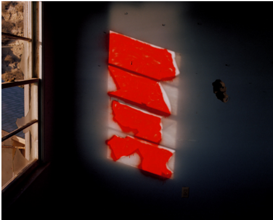
John Divola, from the Zuma series, 1977

With its heightened use of color and modern epic sensibility, the final Zuma series brought together all of Divola's experiments while adding new ones. He photographed one deserted beach house over several months. The images record his own presence mingled with the ongoing vandalism by other anonymous visitors. In its technical virtuosity it can be compared with Jeff Wall's early lightbox tableau The Destroyed Room (1978). Both are carefully staged and equally ostentatious scenes of break-ins. For both, the effects of light and color are central. In Wall's back-lit transparency the image is illuminated from within, lending artistic intention to every bit of the planned chaos recorded by the camera. In the Zuma pictures, the scenes are given to be recorded through the artifice of