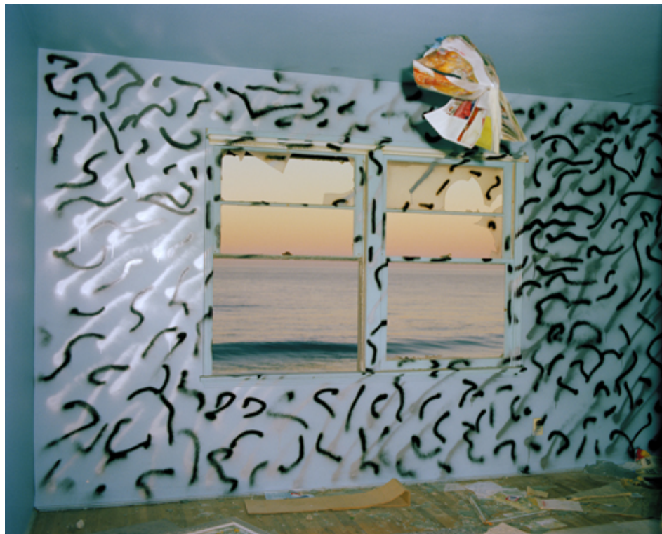
John Divola, from the Zuma series, 1977

Forensic photography emphasises the camera's lens through which passes the stilled world. It tells us the event is over and can be gazed upon at a remove. But nothing signals an event like an instantaneous exposure or a flash strobe that freezes movement. Here the burst of light and the shutter are emphasised along with the lens. The coolness of a lens gives us a slice of space, while a shutter or flash cuts a slice of time. Divola's imagery rarely settles for one or the other. He is not interested in anything clear-cut.